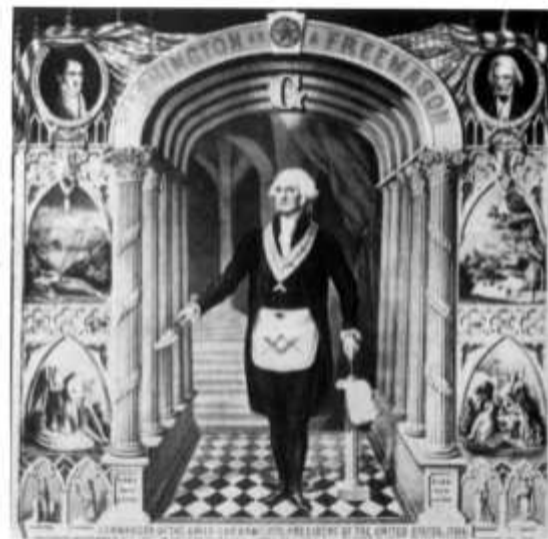
Washington as a Freemason.

Corbett. Apparently Corbett was a religious fanatic who had castrated himself for spiritual purposes. He was later committed to a mental hospital but escaped and was never seen again. It has been suggested that he was a secret member of the infamous Skoptsi sect which flourished in eighteenth- and nineteenth-century Russia. This weird cult traced its origins back to the pagan Mysteries of the goddess Cybele whose priests wore women's clothing and castrated themselves as a sacrificial offering at her altars. This sect may have been introduced into nineteenth century America by Russian immigrants. Rumours persist that Booth escaped from the fire in the barn and lived until 1903 under an assumed name, financially supported by Lincoln's replacement in the White House.